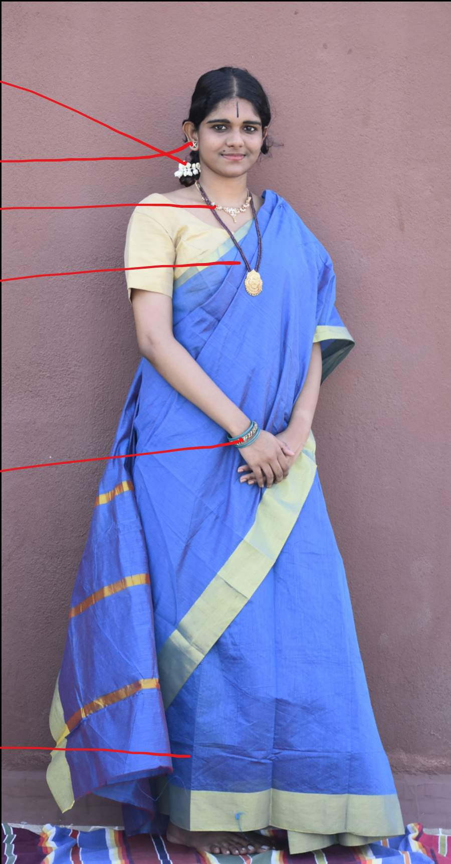
Oshino as Akila

Silk saree Colour used: Blue with gold border with golden blouse