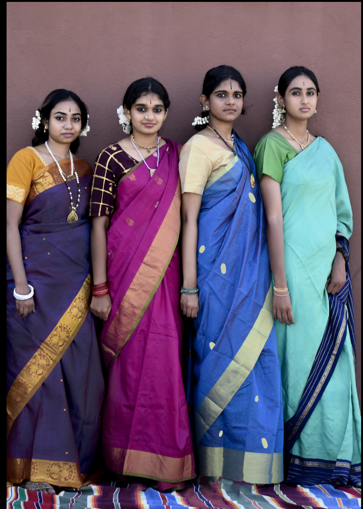
Minor edits on the colour image to match the original image